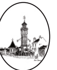
Town and Court Wards