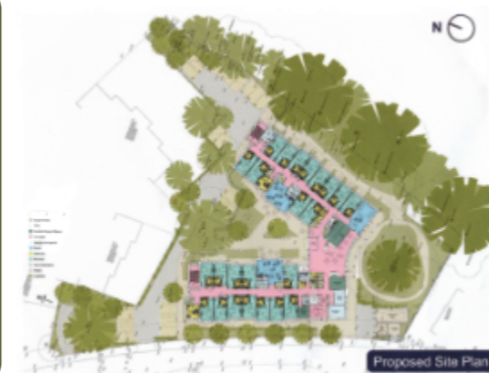
The proposed planning application of "Oak Glade" and artist's impression